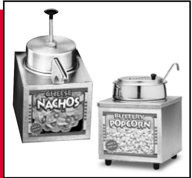
Nacho Cheese Pump and Hot Butter Warmer