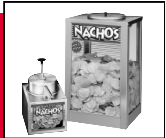
Nacho Cheese Pump with Nacho Cabinet