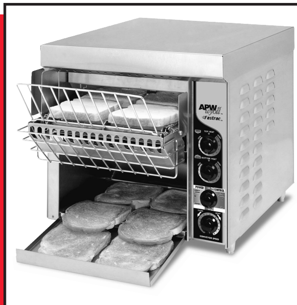
MODEL FT-800 RADIANT CONVEYOR TOASTER