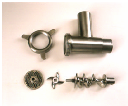
Cast Iron chopping end

Fleetwood model PSE11 is powered by an over sized motor and gear driven transmission. All Stainless Motor housing ensures long life and standard #12 cast iron grinding device insures fresh grinding. This table top meat grinder is perfect for medium and large production : rugged, reliable, compact, easy to clean. Fleetwood's PSE11 is perfect for butcher shops, restaurants, super markets and meat processors. Head and pan easily removable for cleaning.